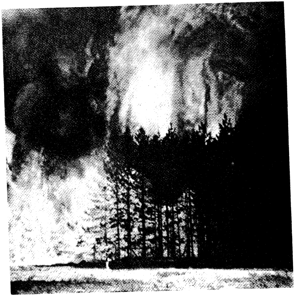
FIG. 1. Fire C6 in the red pine plantation at maximum intensity, moving from left to right. Note person just left of centre.