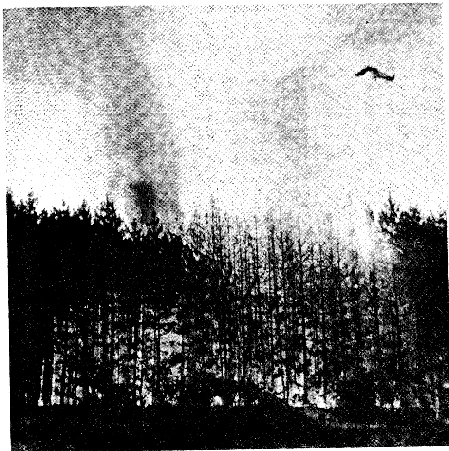
FIG. 2. Fire C4 in the red pine plantation at a stage barely meeting the criteria for active crown fire. Moving from right to left.

was estimated at 0.20 m/s rather than the maximum, 0.28; the intensity as well was correspondingly lower. Fire C4 in this stage illustrates a crown fire just barely meeting the spread rate and mass flow criteria, R_o and S_o . Fire R1 was increasing in intensity when it had to be stopped and is best interpreted as an incipient active crown fire. Note that in both Figs. 1 and 2 the flame front within the stand appears roughly vertical.